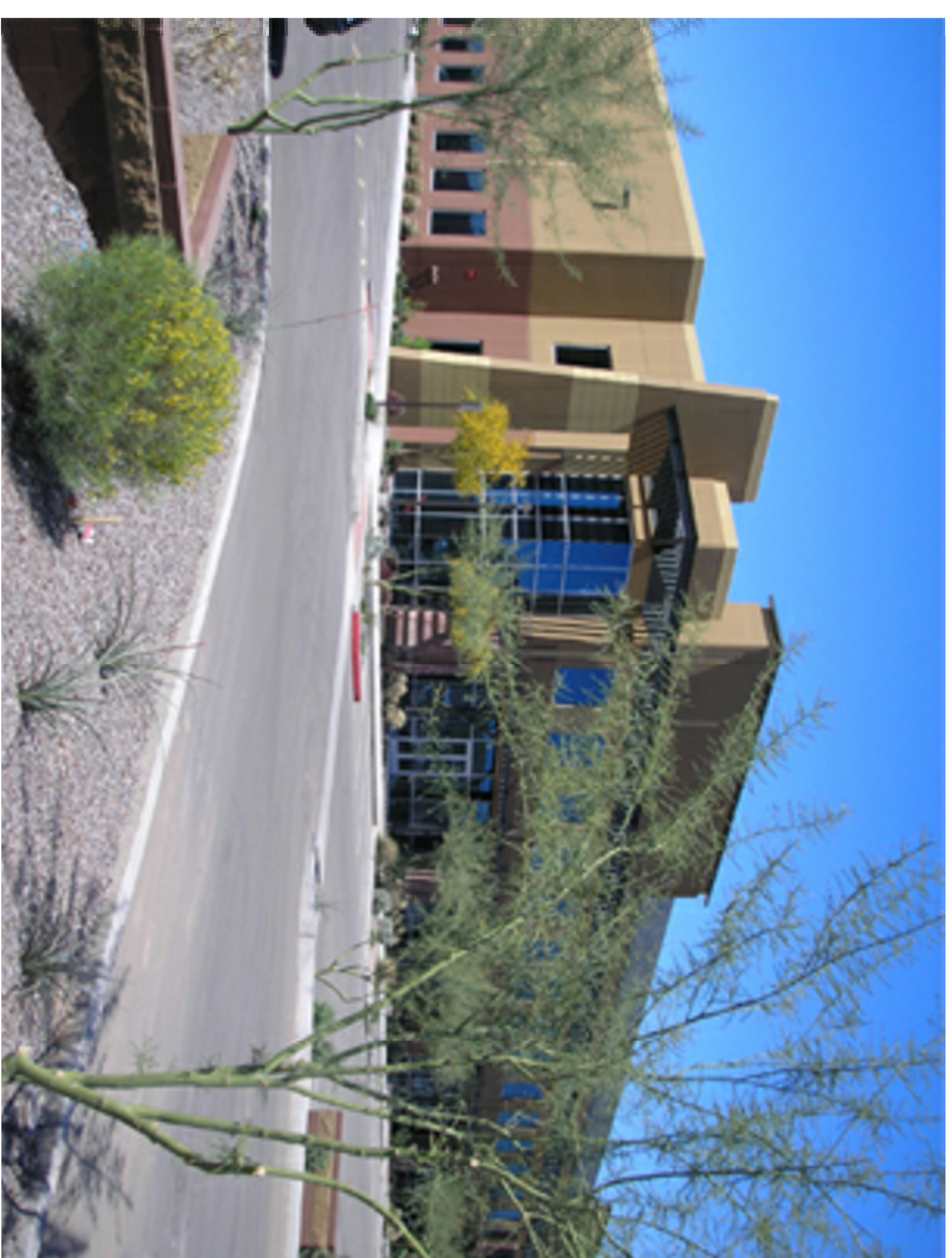
COMMERCIAL/ OFFICE BUILDING 2