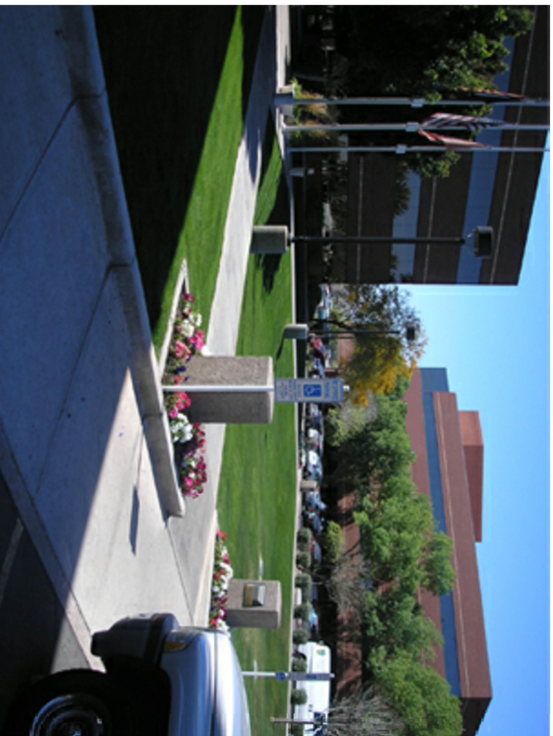
COMMERCIAL/ OFFICE BUILDING 3