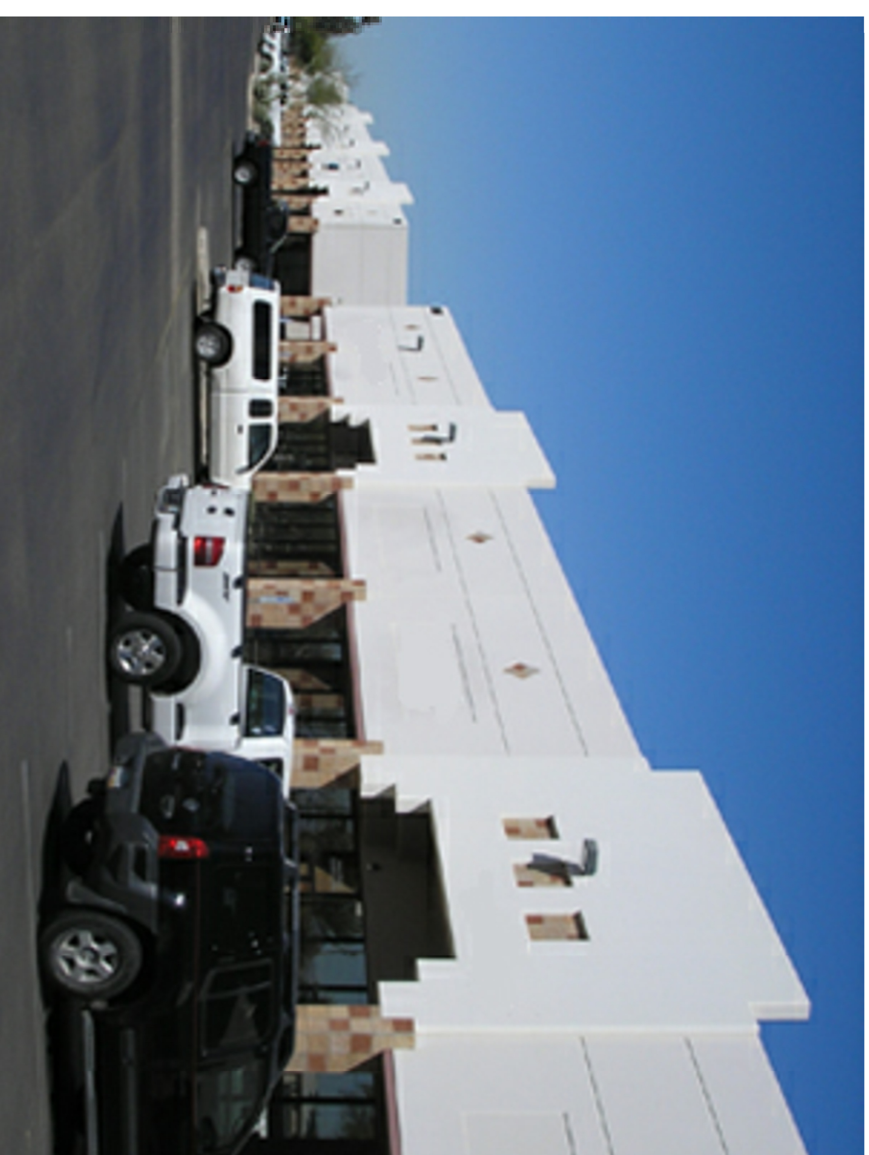
INDUSTRIAL BUILDING 1