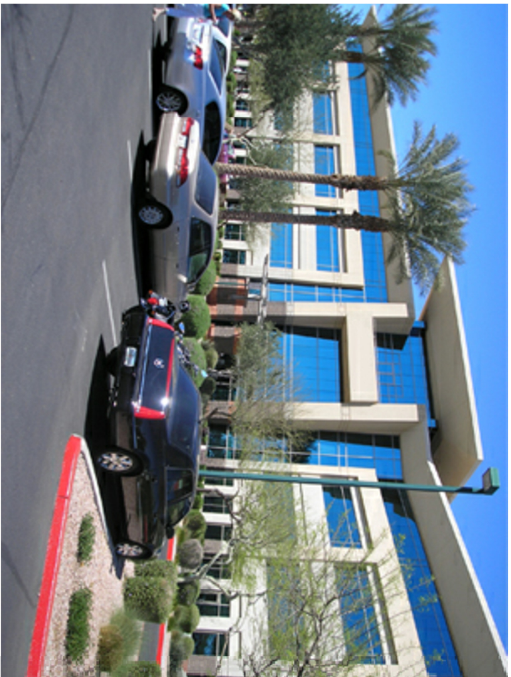
COMMERCIAL/ OFFICE BUILDING 1