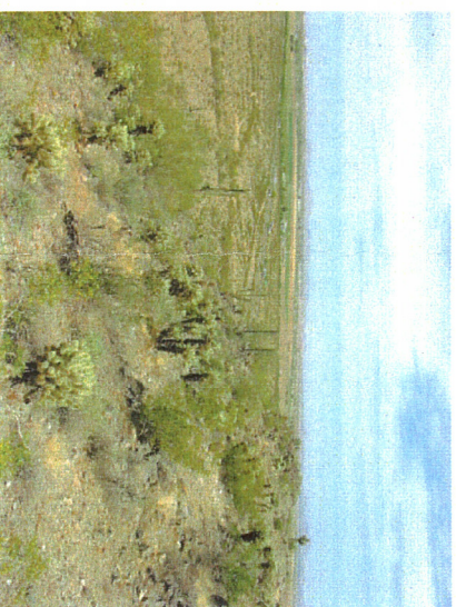
EXHIBIT D1 UPDATED 12-18-13